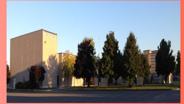
Welland Centennial S.S. in Welland dsbn.org/schools/Centennial

All other secondary schools offer ESL support services on a periodic basis suitable for students whose English language proficiency is already high.