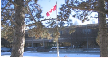
Westlane S.S. in Niagara Falls dsbn.org/schools/Westlane

Our secondary schools provide both academic courses (university preparation) and applied courses (vocational college preparation). Of all our secondary schools, the following three (3) additionally provide a high level of daily ESL support and ESL credit courses for international students: